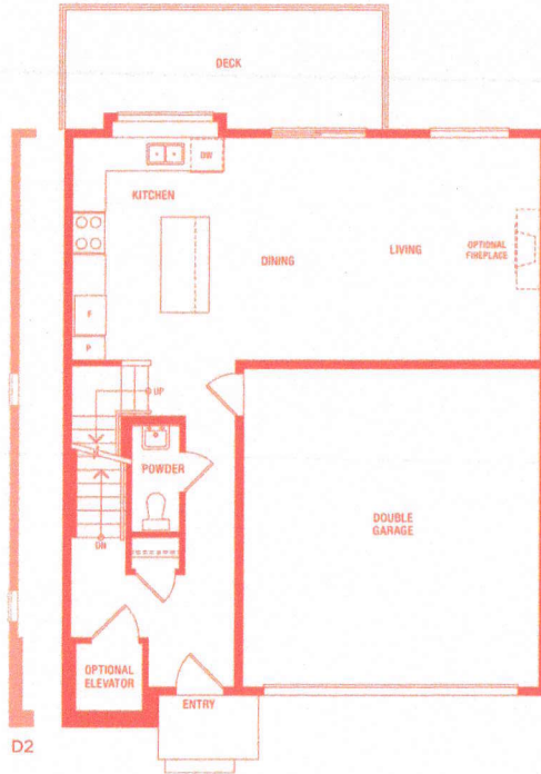
MAIN 623-631 SQFT