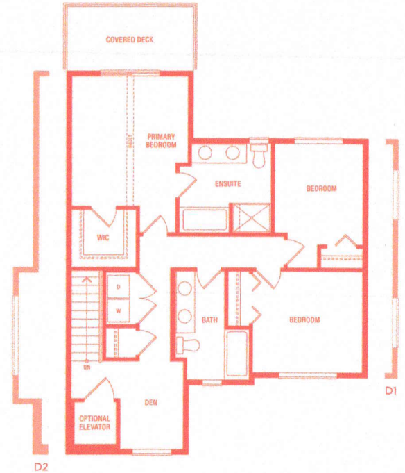
UPPER 848-885 SQFT

The developer reserves the right to make modifications and changes to the building design, elevations, dimensions, specifications, features and prices without prior notification. Decks, patios, stairs and windows may vary based on site conditions. All sizes and dimensions are approximate and based on architectural measurements. Reverse and/or mirror plans occur throughout the development. Please see disclosure statement for specific offering once available. E & O.E.